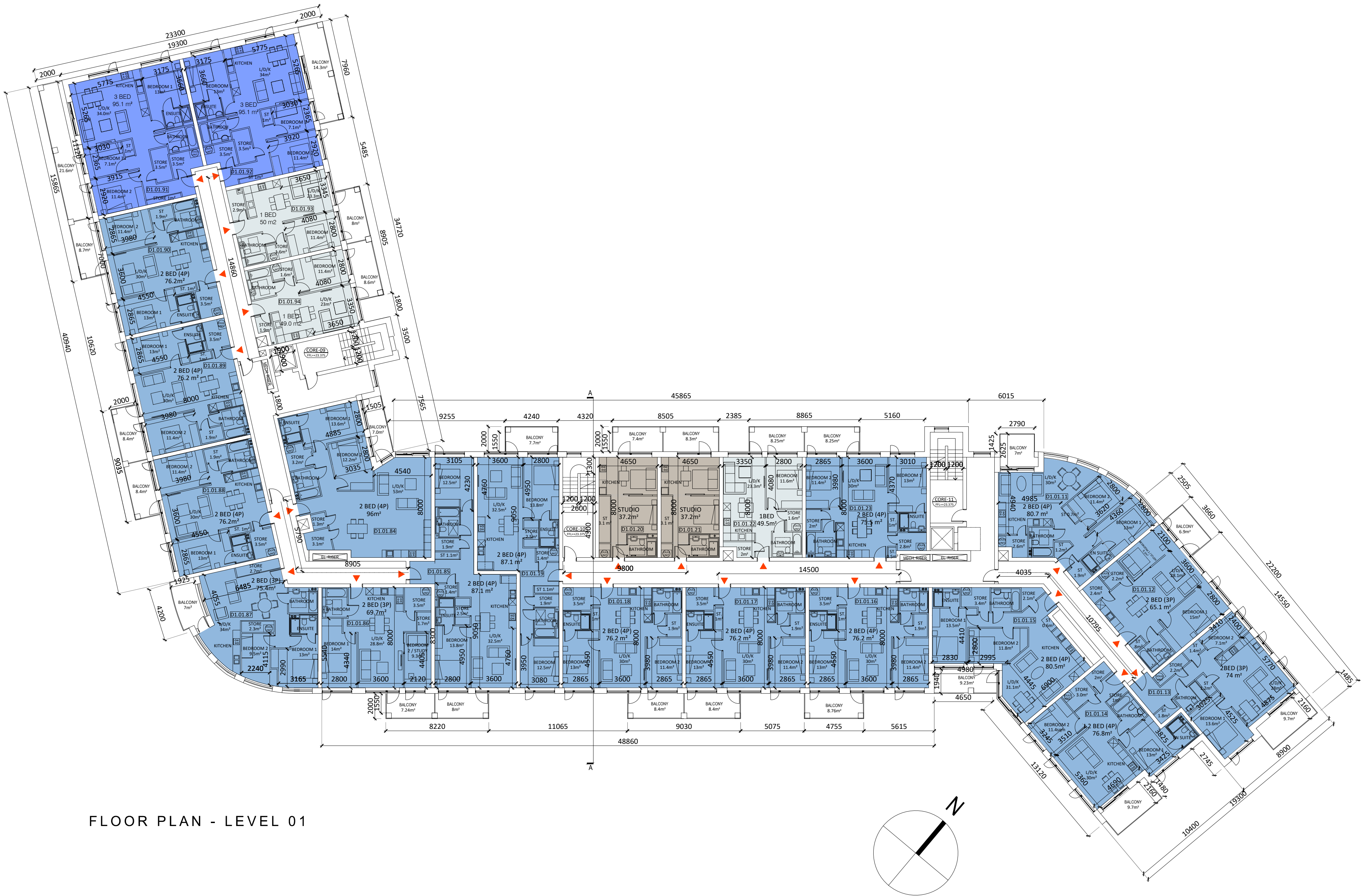
FLOOR PLAN - LEVEL 01